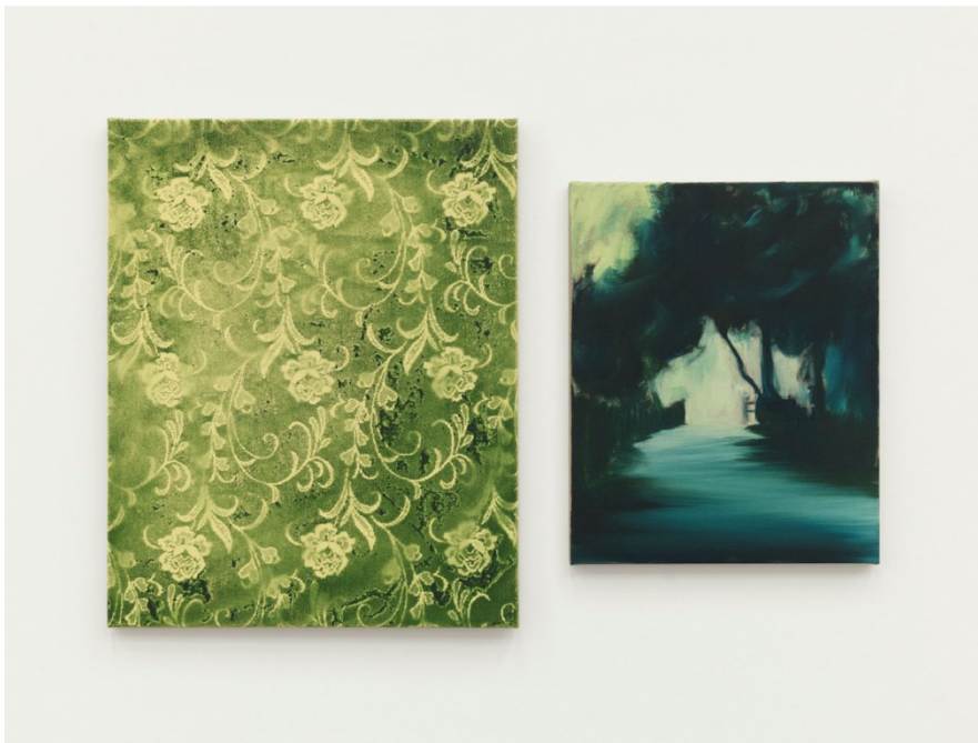
Rachel Howard, Sleepless WW (2021). Oil on linen in two parts. Left panel: 61 x 50.8 cm; Right panel: 45.7 x 38.1 cm.

Returning to Regent's Park, Frieze London (13–17 October 2021) is one of the most anticipated art events in the U.K. this autumn, along with the return of 1-54 Contemporary African Art Fair at Somerset House (14–17 October 2021). We compile a definitive guide of must-see exhibitions taking place alongside the fairs.