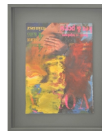
Hugo Canoilas Voilà , 2013 Lacquer on printed paper 31 x 38.5 cm 12 1/4 x 15 1/8 in (HC0094)