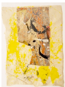
Hugo Canoilas Noite Ocidental | Western night , 2013 Collage on canvas)