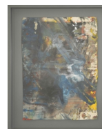
Hugo Canoilas Socrates , 2013 Lacquer on printed paper 45.5 x 36.75 cm 17 7/8 x 14 1/2 in (HC0135)