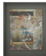
Hugo Canoilas Atenas , 2013 Lacquer on printed paper 45.5 x 36.75 cm 17 7/8 x 14 1/2 in (HC0142)