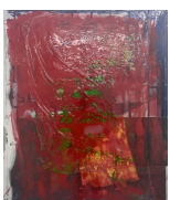
Hugo Canoilas Lotto or Revolution , 2014 Epoxy resin and pigment on digital print, mounted on aluminium