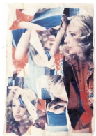
Hugo Canoilas In my dream, you , 2013 Collage on canvas