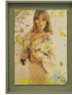
Hugo Canoilas You learn to love the light , 2013 Lacquer on printed paper