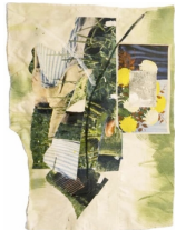
Hugo Canoilas From to its body: the soul returning , 2013 Collage on canvas