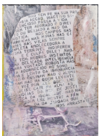
Hugo Canoilas With no faith in his own actions (...) No one showing the slit of the raft that carries us, 2014 epoxy and pigment on colour photo, mounted on aluminum