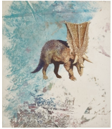
Hugo Canoilas Picasso head , 2016 Ink on linen