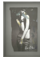
Hugo Canoilas Earl Jeans , 2013 Lacquer on printed paper