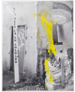
Hugo Canoilas Not even one more soldier , 2014 epoxy and pigment on black & white photo, mounted on aluminum