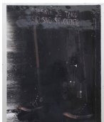
Hugo Canoilas A poet is a minuscule thing , 2014 Epoxy resin and pigment on digital print, mounted on aluminium