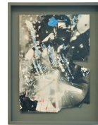
Hugo Canoilas The Sun Shines In Mexico , 2013 Lacquer on printed paper