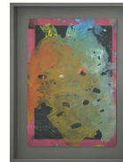
Hugo Canoilas The house taken by a bronze anonymous light , 2013 Lacquer on printed paper